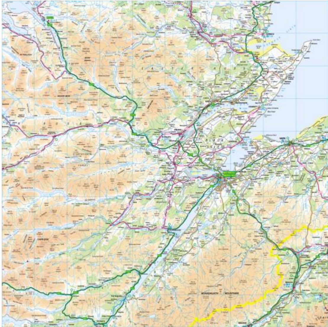
Map NH: Central Highlands, relevant locations referenced in the reports are in the top left-hand corner - Loch Broome