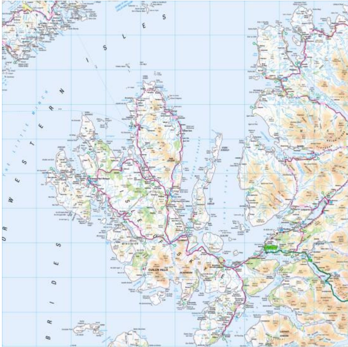
Map NG: West coast - Loch Torridon area