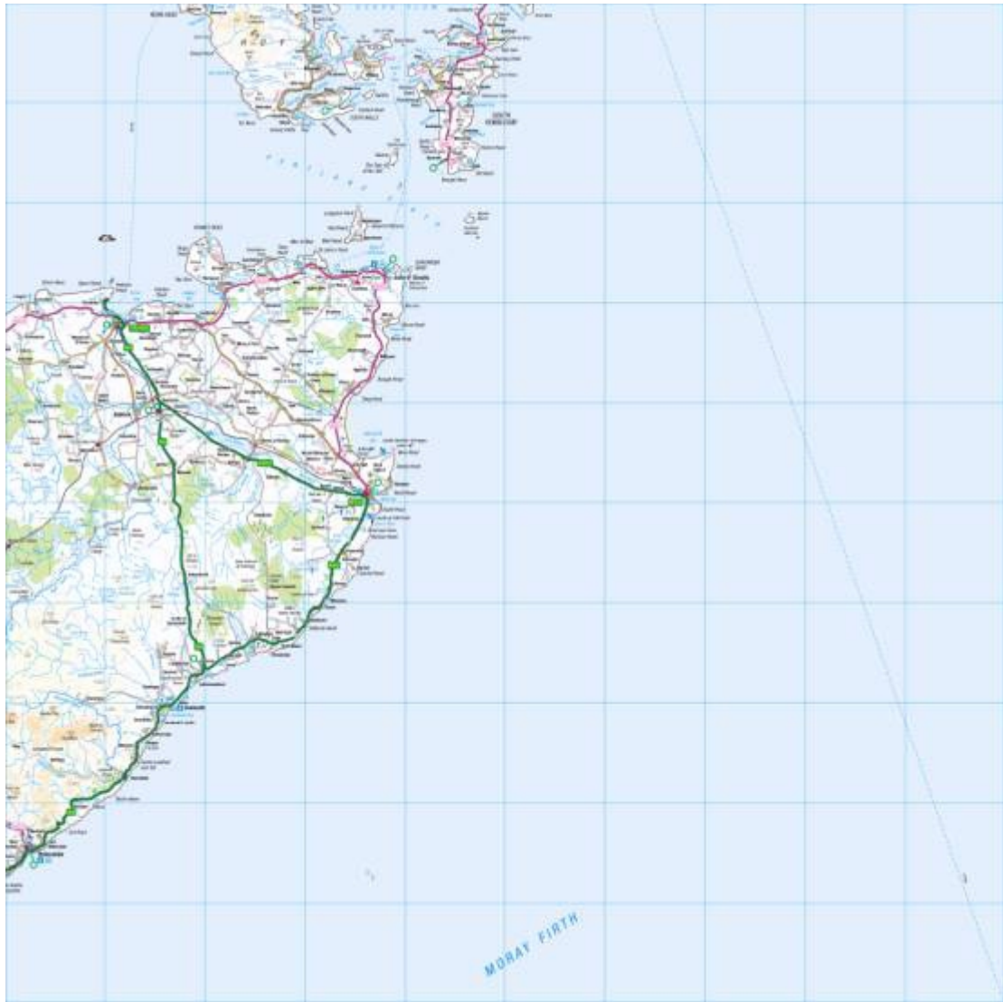
Map ND: North Coast, eastern part - Thurso, etc